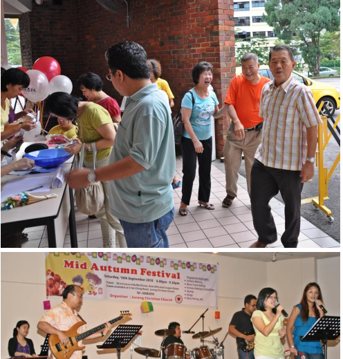
at least take down the names of those who came up for prayer. Let's be ready the next time.